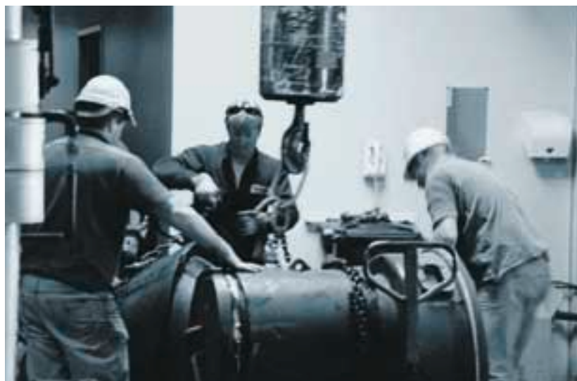
■ The various stages of the two centrifugal chillers removal and replacement at the LISWA.

this area has received very positive feedback from clients.