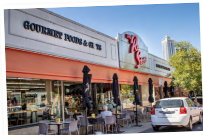
THE RE STORE

youtu.be/no2I5J_VmV8 slwa.info/italian-resources