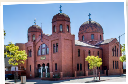
GREEK ORTHODOX CATHEDRAL

40 minutes The first Greek people who came to Australia arrived in the 1820s. There have been many waves of Greek migration since then. The largest periods of migration occurred between the 1950s and 1970s. The Greek Orthodox Church provided familiarity to the Greek migrants. They worked together to raise funds and build what is now the Cathedral of St Constantine and Helene. Northbridge has had centres for many different faiths, including Greek Orthodox, Jewish, Catholic, Muslim and Protestant.