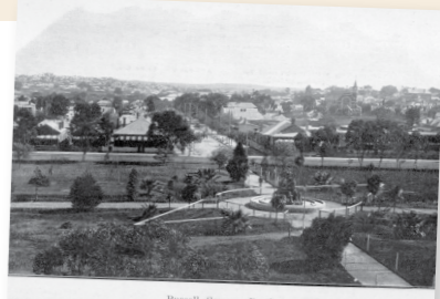
Russell Square, Perth.