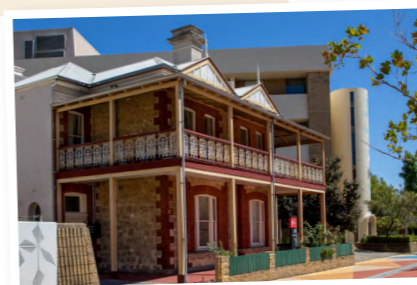
27 MUSEUM STREET

In the late 19th century, there was a rapid expansion of building in Western Australia during the gold boom when many new migrants arrived. Perth Mosque was built on William Street in 1906 with money raised by Afghan cameleers.