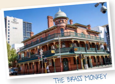
THE BRASS MONKEY

5 minutes The history of Northbridge has been formed by more waves of migration than any other area of Western Australia; this rich, ethnic diversity has shaped its character.