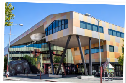
NORTH METROPOLITAN TAFE

Today new Western Australians can access classes at North Metropolitan TAFE, including English tuition. Approximately 170,000 people arrive each year to live in Western Australia, but recently even more people have been leaving. Flows of migration change all the time.