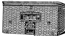
NEW PATENT CONTINUOUS OVEN.