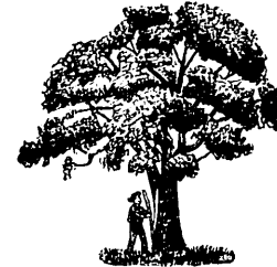
Stripping Cork Tree