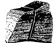
Cork Tips for Cigarettes